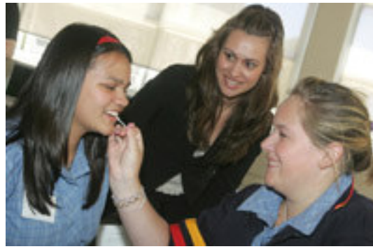
Students practice applying natural makeup